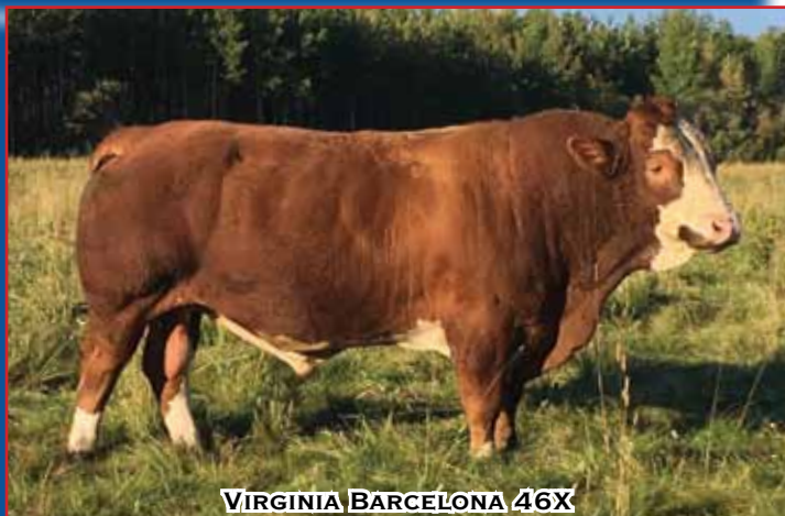
VIRGINIA BARCELONA 46X