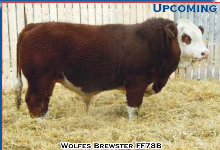
WOLFES BREWSTER FF78B