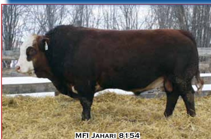
MFI JAHARI 8154