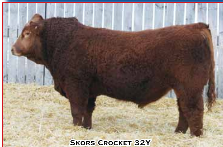
SKORS CROCKET 32Y