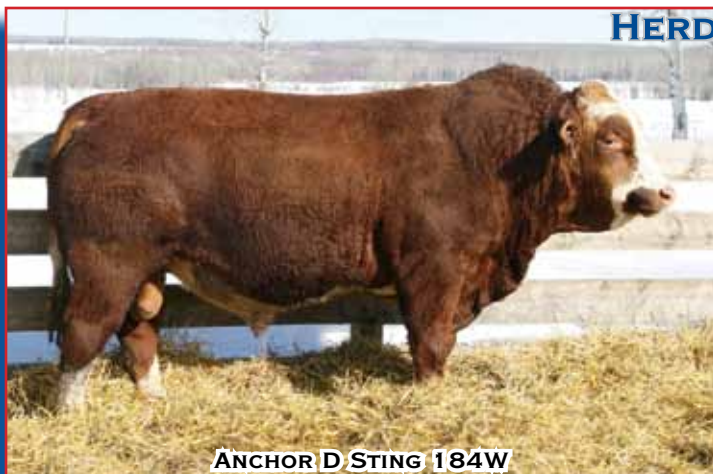
ANCHOR D STING 184W