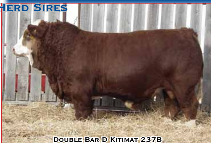
DOUBLE BAR D KITIMAT 237B