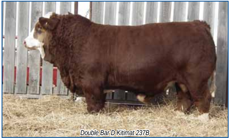
Double Bar D Kitmat 237B