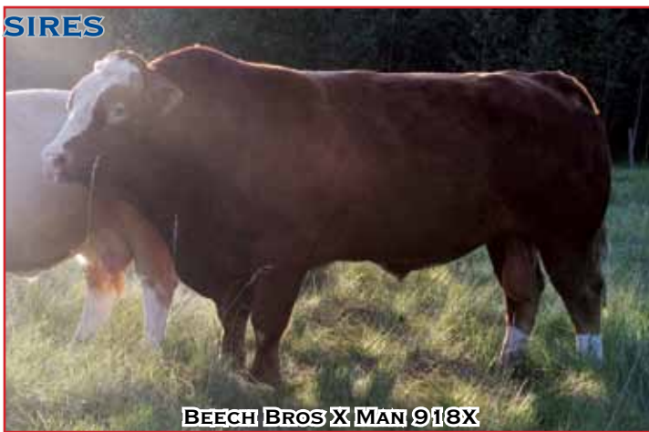
BEECH BROS X MAN 918X