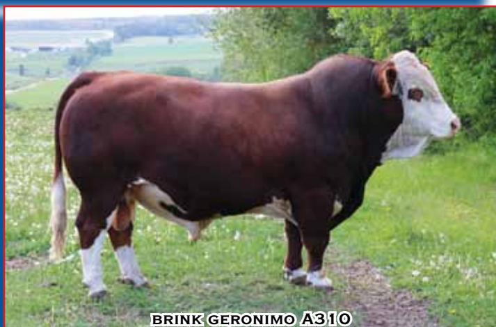
BRINK GERONIMO A310