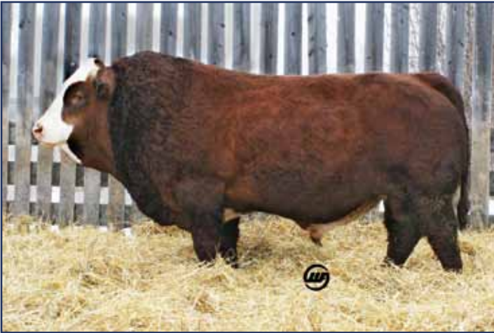
RWR SULLY 9E -1211279