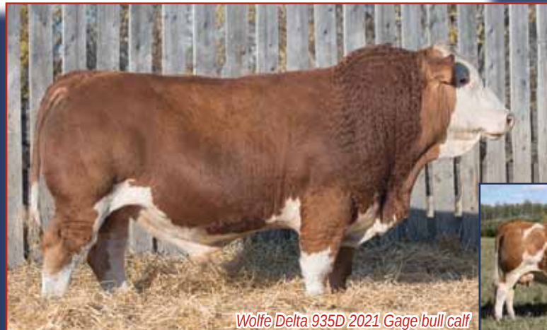
Wolfe Delta 935D 2021 Gage bull calf