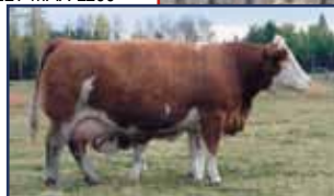
Great Guns Mitzi 11X-great granddam