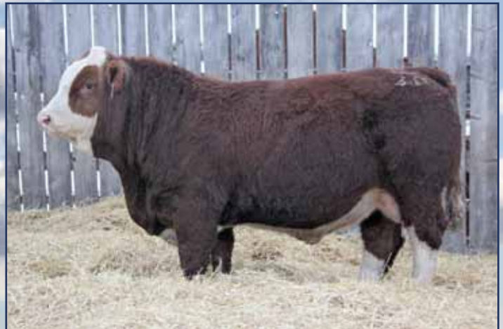
ANCHOR D OZARK 81G