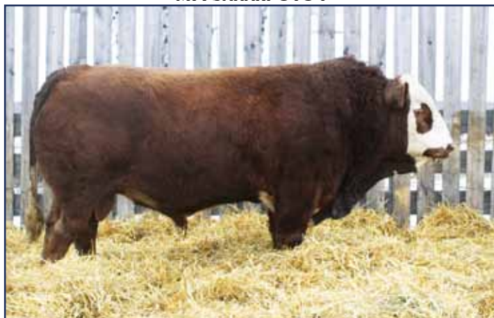
WOLFE BIRNER FF 318B