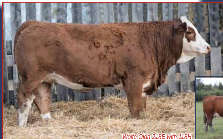
Wolfe Olga 218E with 118H