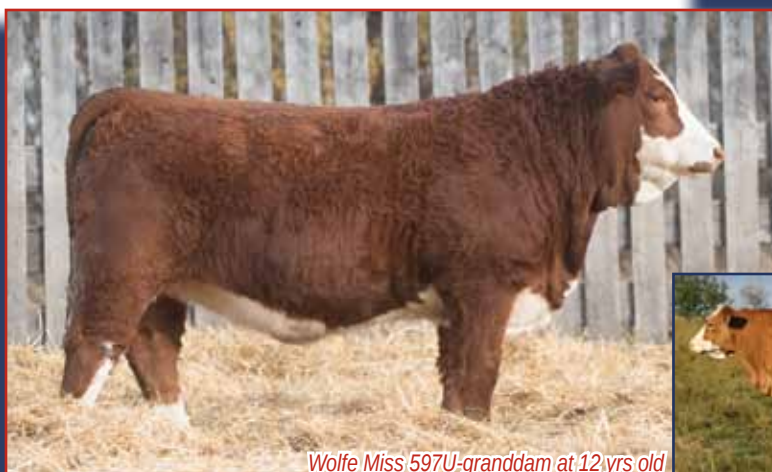
Wolfe Miss 597U-granddam at 12 yrs old