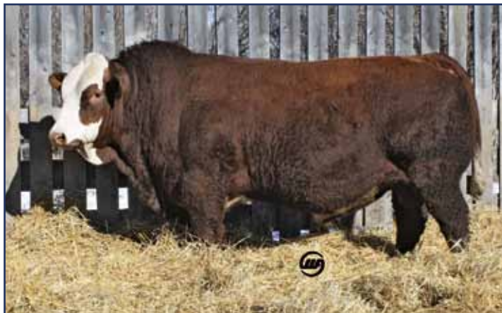
BLACK GOLD ELEVATION 20E