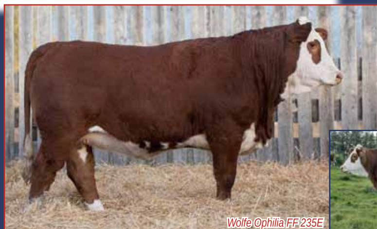
Wolfe Ophelia FF 235E