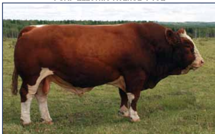
WOLFES DYNAMITE FF19D