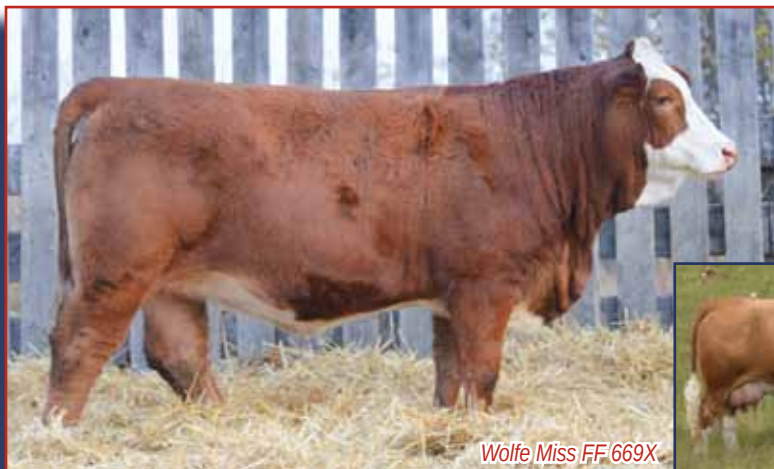
Wolfe Miss FF 669X