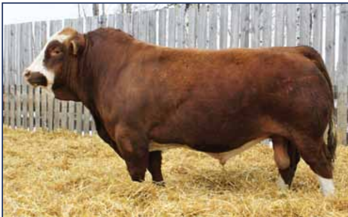
ANCHOR D STING 184W