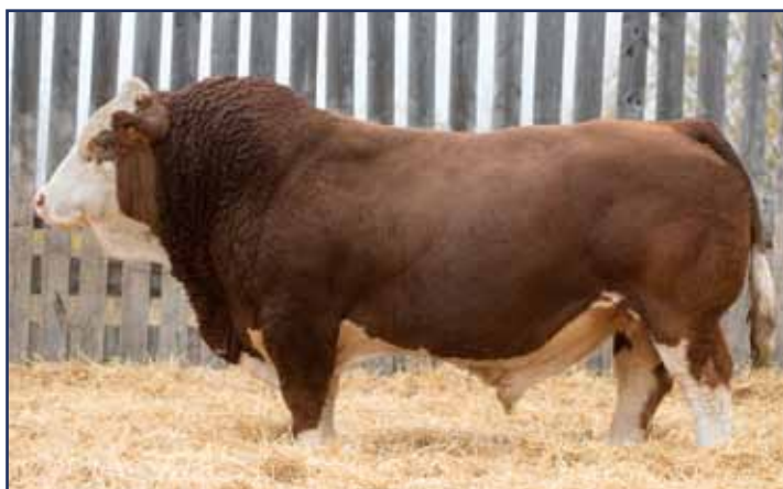
BRINK CUSTER E773