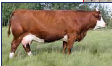
Wolfe Bindy FF 830B