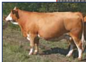
Swantewitt Claire 188C