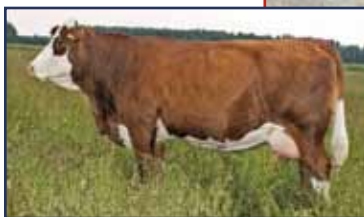
Wolfe Australia FF 810A-granddam

BRINK BULLET PROOF A342 BRINK TARA Z293 ET MFI JAHARI 8154 WOLFE MISS FF 679X