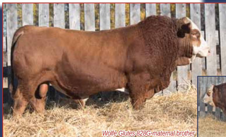
Wolfe Glutes 828G-maternal brother