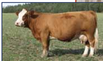
Moose Creek Princess 225R-granddam