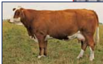
Wolfe Audry FF 804A