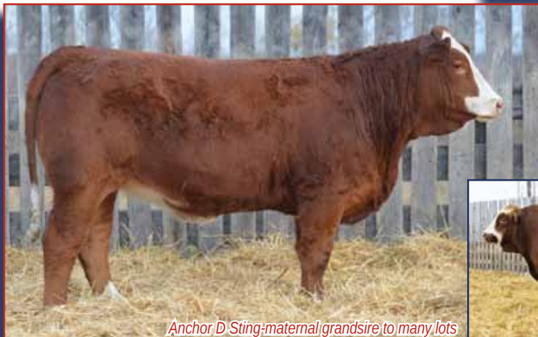
Anchor D Sting-maternal grandsire to many lots