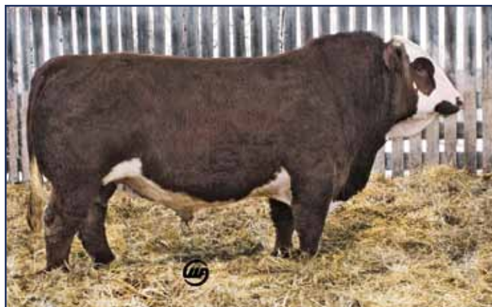
FGAF ELECTRIC AVENUE 140E