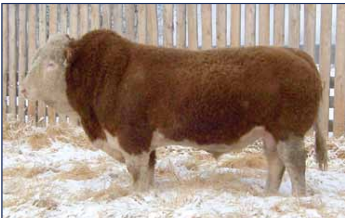
WOLFE'S PASTA FF510N