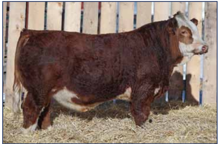
CLEARWATER HUGH 26H -1333502