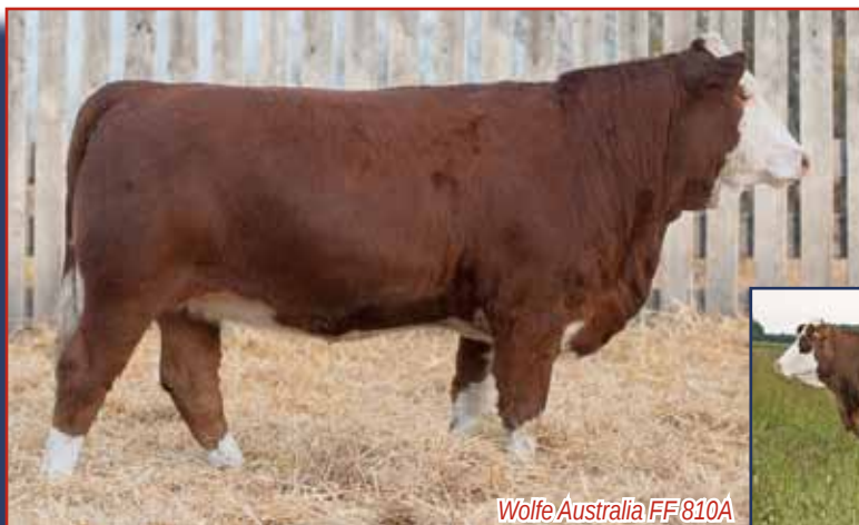
Wolfe Australia FF 810A