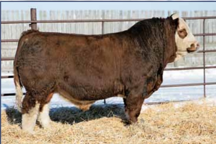
DOUBLE BAR D TRADER 19H