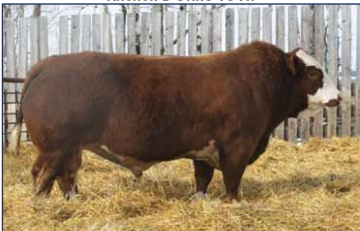
VIRGINIA BARCELONA 46X