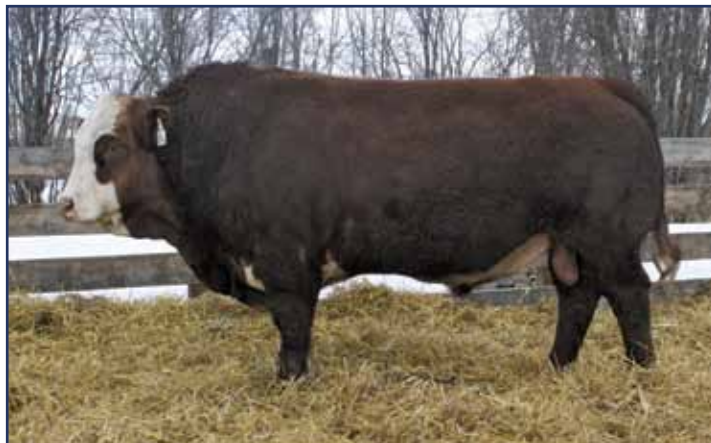
MFI JAHARI 8154