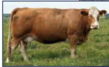
Wolfe Yeda 708Y-granddam