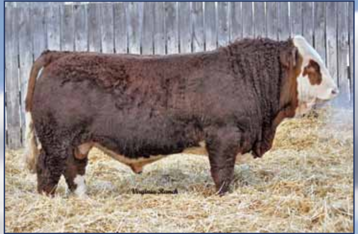
VIRGINIA GAGE 34G