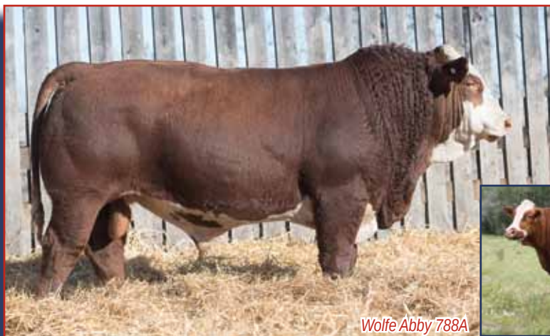
Wolfe Abby 788A