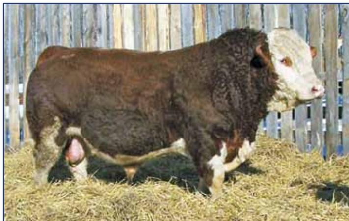
WOLFES STETSON FF 35S