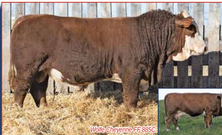
Wolfe Cheyenne FF 885C