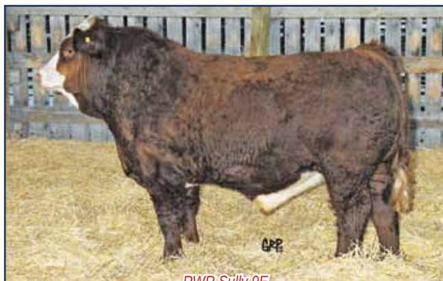
RWR Sully 9E