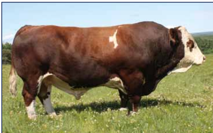
BRINK GERONIMO A310