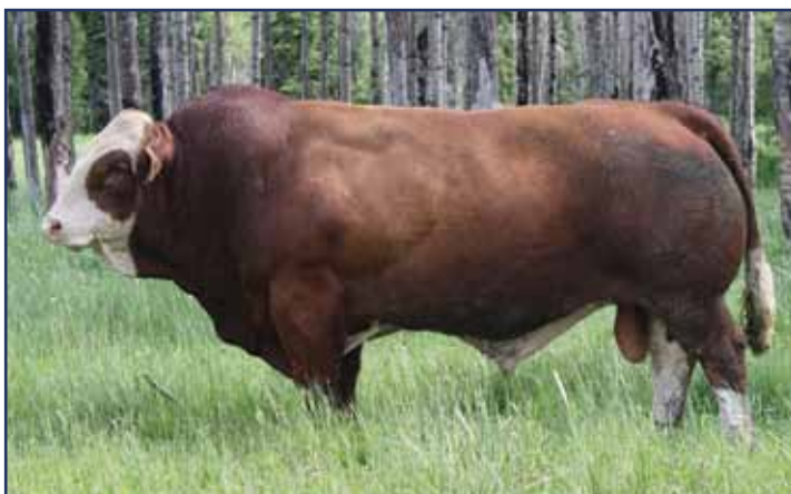
DOUBLE BAR D AERO 298B