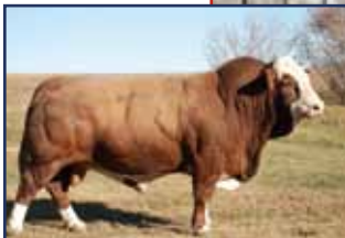
WLSF Abesly-paternal grandsire