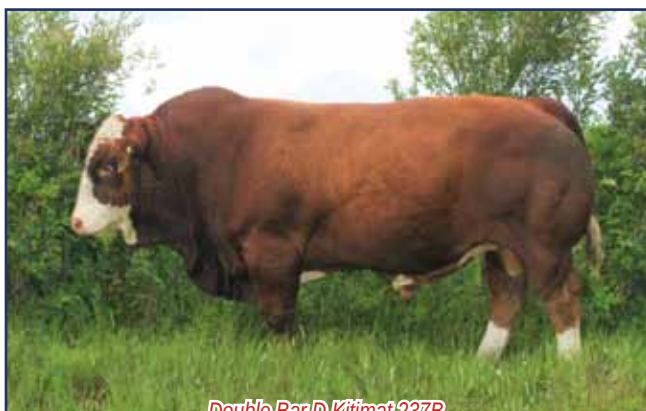
Double Bar D Kitimat 237B