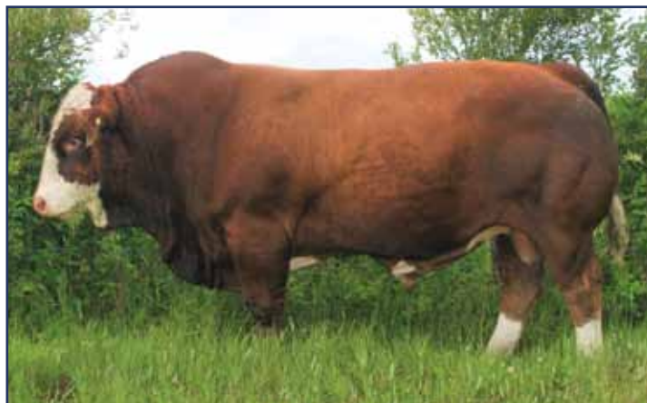
DOUBLE BAR D KITIMAT 237B