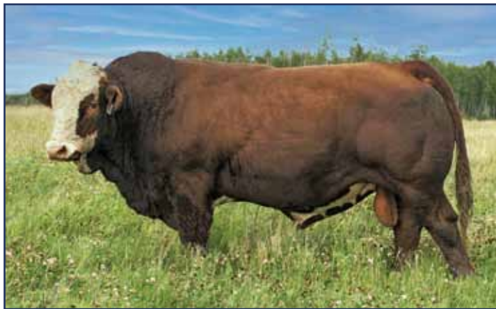
BLACK GOLD ELEVATION 20E