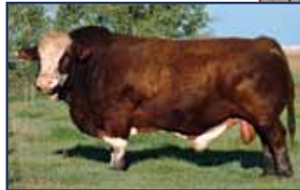
MFI Bambam-paternal grandsire

BW: 99. Dec 13/19wt: 631. May 20/20wt: 1027. EPDs: 0.1 7.0 81.0 107.4 29.8 -0.4 70.3 - Another great Broker son. - Lots of hair on this scurred, blonde bull. - One of the younger bulls on offer.