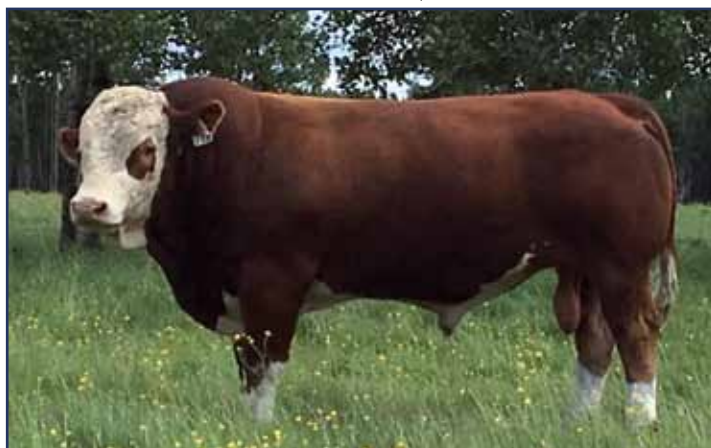
WOLFES BREWSTER FF 78B