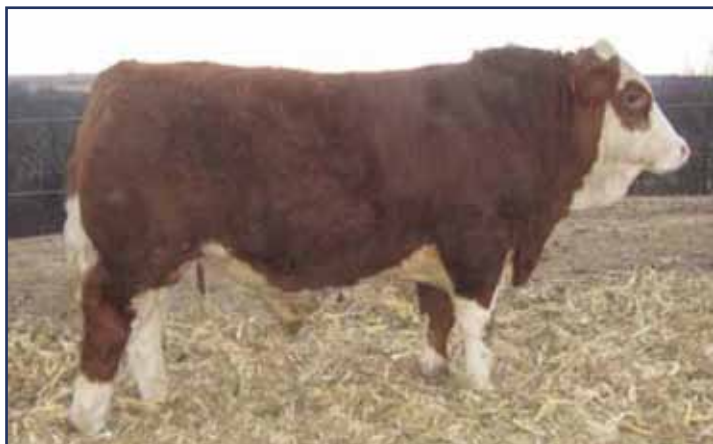
BRINK CUSTER E773