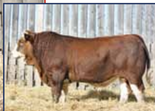
Wolfe Fate 946F