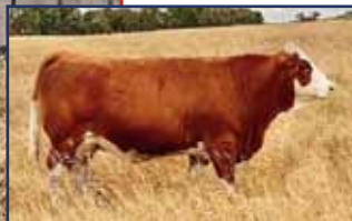
Double Bar D Lolita 188Z-paternal granddam