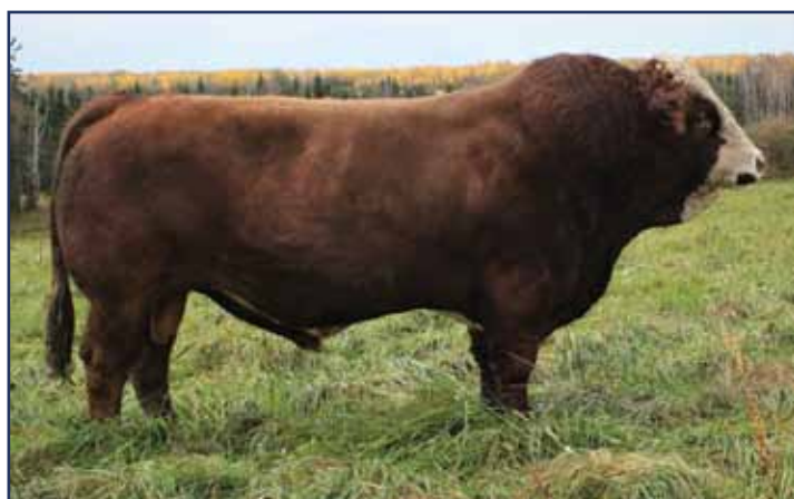
RICOCHET RUSH 644D